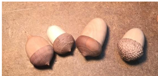
Sawdust Session Attracts 5 Nuts

Alan will also lead a workshop on Saturday/Sunday (August 15-16) for those interested. The cost will be $220 for the weekend. This one will fill up quickly, so please sign up soon.