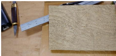
FIGURE 2 SQUARING THE BLANK

I used a piece of white oak for these chucks (Figure 1). White oak is an okay species – cherry, hard maple, or any other fine-pored, close-grained wood would work just as well. I would stay away from red oak, and other softer woods, because this bit is about to turn into a faceplate, and you'll want it to be durable.