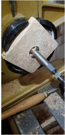
FIGURE 6 TAP THE HOLE

The rest of this is straightforward. Mount your new “faceplate” on the lathe spindle and test the fit. It should turn on snugly but not overly so. Your next step is to turn the square into a round, if you did not do that on the bandsaw. Make the round a little larger than the outside diameter of the piece of pipe or coupling you’re using, and then turn a round tenon that just fits inside the pipe/coupling. You want a nice snug fit here, because minimizing air leakage is important. Glue the pipe and wooden faceplate together using 2-part epoxy, which also helps seal this joint, because epoxy is a gap-filling glue.