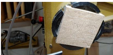
FIGURE 3 MOUNTING THE BLANK

Next mount one of the squares on your lathe. I used a four-jaw chuck (Figure 3). Note that it is not critically important that this piece be exactly centered on the spindle, because you are going to turn it round. If your center mark does not line up precisely with your drill in the next step, don't sweat it. It's not an issue.