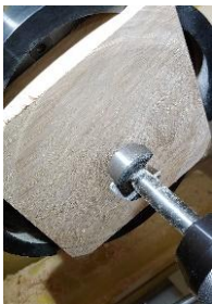
FIGURE 4 DRILL A CENTER HOLE

Next, use a Forstner bit 1/8" smaller than the diameter of your Beall spindle tap, and drill a hole in your blank (Figure 4). I like to do this on the lathe, but you could use a drill press too, if you prefer. Again, if this hole does not line up with your center mark, it's still okay at this point. Drill slowly, back the drill out of the cut often to clear the chips, and be sure to turn down the speed of the lathe. You don't want to burn this hole or overheat the drill bit.