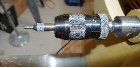
FIGURE 5 A TAP FOLLOWER