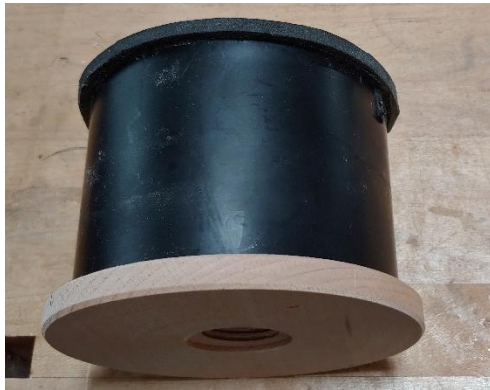
FIGURE 8 A FINISHED CHUCK

Next month I will describe the process of evacuating the air from the spindle and creating a vacuum inside your new chuck. Questions? Drop me an email!!