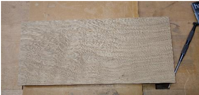
FIGURE 1 THE RAW MATERIAL

I used a piece of white oak for these chucks (Figure 1). White oak is an okay species – cherry, hard maple, or any other fine-pored, close-grained wood would work just as well. I would stay away from red oak, and other softer woods, because this bit is about to turn into a faceplate, and you'll want it to be durable.