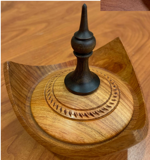
Some bonus project work by Roger!