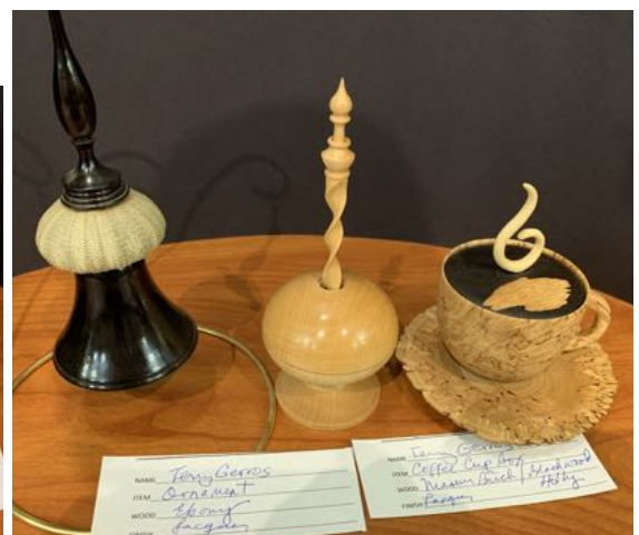
NAME Terry Gerros ITEM Ornament WOOD Ebony FINISH Facades