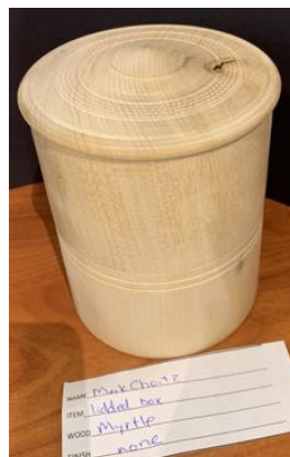
NAME Mark Chait ITEM Lidded box WOOD Myrtle FINISH none