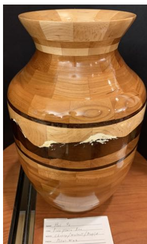
NAME Hal S ITEM Two piece vase WOOD Cherry, maple, ash FINISH Alex WXX