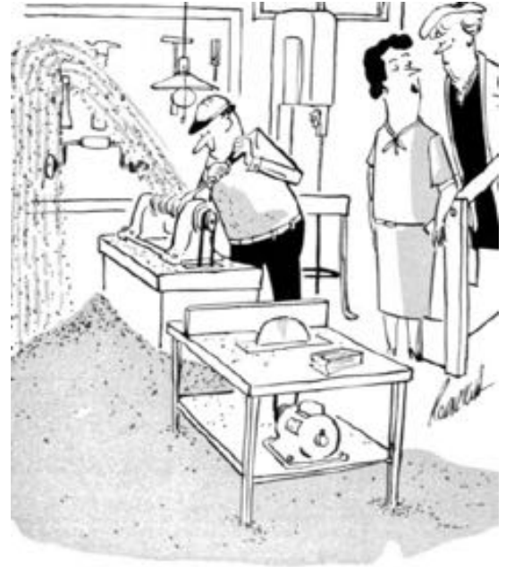
"So far, he's made two things - sawdust and noise."

My wife noticed a scratch on my cheek yesterday and asked, "How did you get that?" I responded that, "I had an encounter with a flying saucer". She said, "No. Really, what happened?" "Well, it might have been a shallow bowl. I hadn't decided yet."