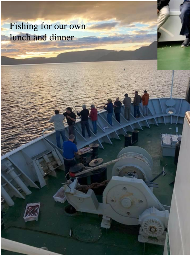
Fishing for our own lunch and dinner