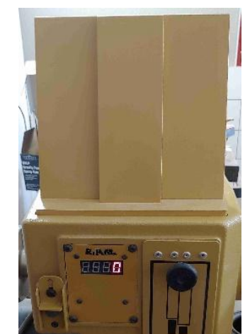
Figure 2 Painted and in place