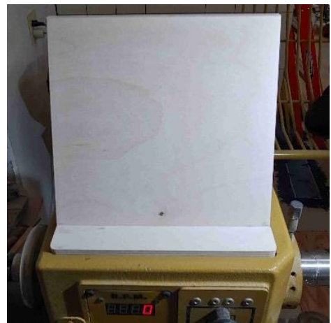
Figure 1 Testing the fit of the mounting base