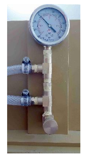
Figure 3 Manifold and bleeder valve

I use a vacuum bag as a veneer press in my furniture making, and decided to try that vacuum pump for this application. I mounted it on a small purpose-built platform (Figure 4) screwed to the wall near my lathe and connected it to the manifold with reinforced tubing. I purchased a lathe accessory from Craft Supplies USA to deliver the vacuum through the headstock spindle to the chuck's interior (Figure 5).